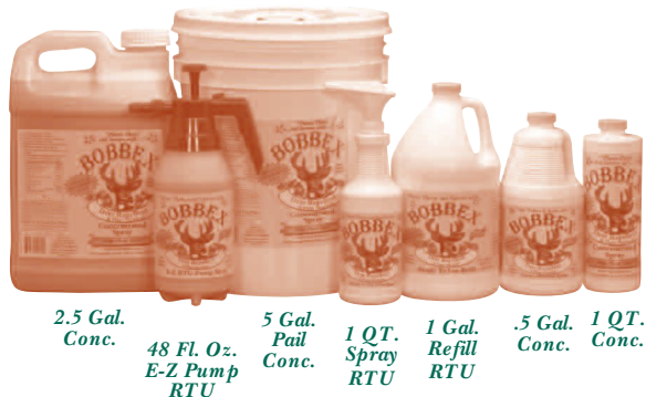
2.5 Gal. Conc. 48 Fl. Oz. E-Z Pump RTU 5 Gal. Pail Conc. 1 QT. Spray RTU 1 Gal. Refill RTU .5 Gal. Conc. 1 QT. Conc.

BOBBEX and BOBBEX-R are available in these sizes: